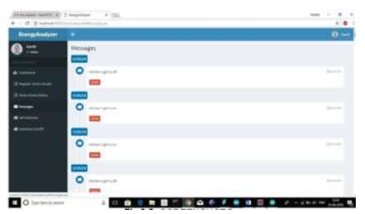
Fig 2 : Notification of System