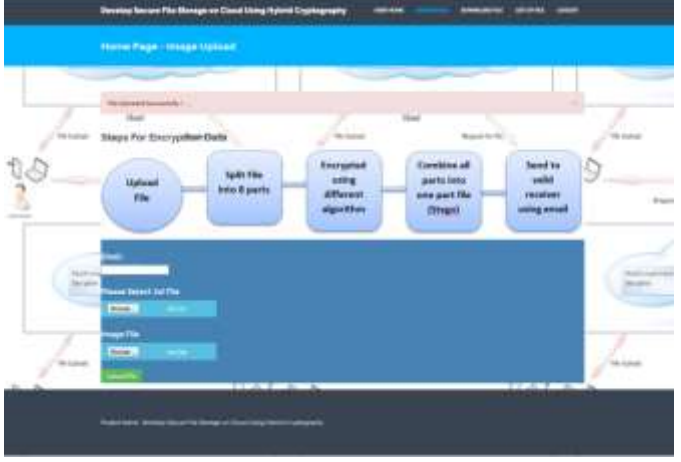
Fig: File Upload