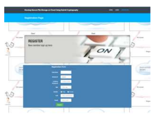
Fig: Registration Form