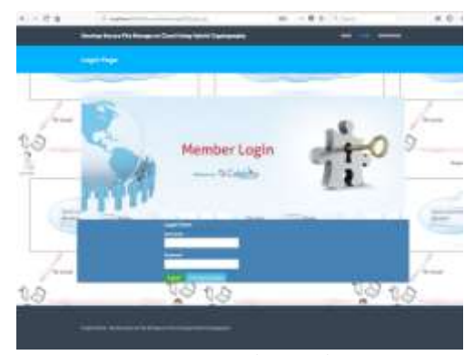
Fig: Login Form