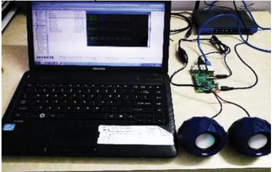
Figure 1: Sample UI

We will centre on separating highlights from pictures of a content and change over them in to sound. Filtered pages of content will prepare the classifier while pictures taken by camera will change over that picture content into sound. We plan to accomplish more writing research on archive picture recovery, join and enhance them by keeping memory require little in the meantime. We will probably find the ideal exchange off between preparing speed and coordinating exactness, and to make a showing of this idea on raspberry pi. The camera would take a photo of content and naturally play back the applicable time stamp of its relating book recording.