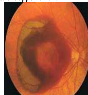
Fig.4.1. Eye image for Age-related Macular Degeneration (AMD)

Now-a-days, ocular diseases are increasing in the aged group of population. Lack of awareness, inadequate medical facilities and other such issues lead to patient inconvenience and even loss of vision. To overcome this scenario, early and accurate diagnosis of the ocular disease is necessary so as to provide the required and proper medical assistance to the patient. The system proposed in the project enables the accurate detection of the ocular disease by analyzing the eye image of the patient. If the system detects that the disease is at initial stage than a medical prescription is given to the patient. And if the patient is at high risk, an ophthalmologist (eye expert) is being consulted for expert advice and further medical treatment. This system also helps to reduce the inconvenience caused to the patient while taking a medical appointment, reduces load on urban infrastructure by efficiently managing the expert and patient appointment.