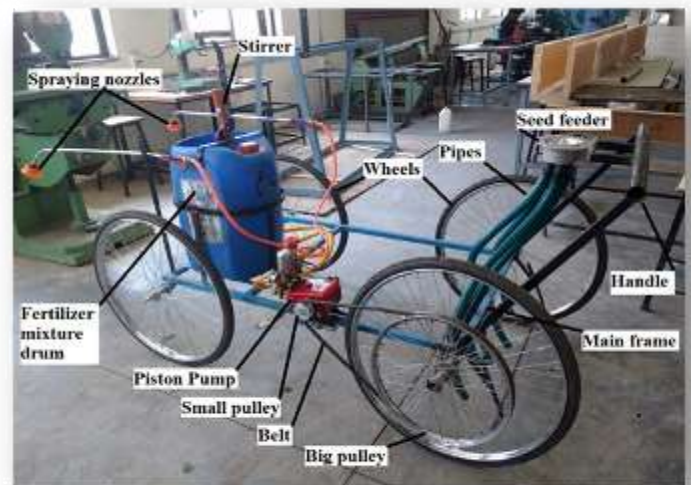
Fig. 5: Multipurpose Agriculture Vehicle

Chemicals are widely used for controlling disease, in sects and weeds in the crops. They are able to save a crop from pest attack only when applied in time. They need to be applied on plants and soil in the form of spray, dust or mist. The chemicals are costly. Therefore, Equipment for uniform and effective application is essential. so to adopt new method of applying chemicals, by using chemical sprayer equipment.