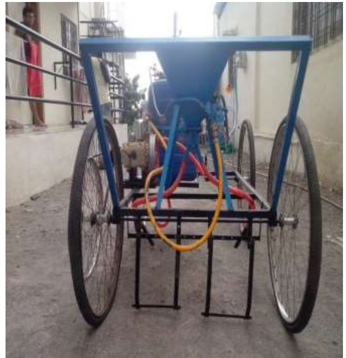
Fig.4: Ploughing System

It is the best and economic to farmers in today's world without any huge investments and it can be worked without any external source like (electrical, solar energy) and we can contribute today's world without air pollution and water pollution. And it can accessed by any kind of farmer at low cost. The recommended down to row spacing seeds rate, seed to seeds spacing and depth of seed placement vary from crop to crop and for different agro-climatic conditions to achieve optimum yields. To improve the soil conditions by reducing evaporation from the soil surface, improve infiltration of rain or surface water; reduce runoff to maintain ridges or beds on which the crop is grown and to reduce competition of weeds for light, nutrients and water.