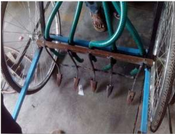
Fig.3: Bio-fertilizer Spreading System

Sowing and Fertilizer is used for line sowing and fertilizing of cereals and other crops. It is a low cost line-sowing device in which seed metering is done manually by the operator by dropping the seeds in the funnel provided for the purpose. This is the second assembly of agriculture multipurpose vehicle ,which is useful for insertion of bio-fertilizer in the farm .For insertion purpose, we prepared one hopper through which we are able to insert the fertilizer for base of that hopper we kept one control valve & below that control vale two separate branching is there for insertion of bio-fertilizer in two separate sides for covering more area .The arrangement of this branches is in such way that we are able to arrange that distance depending on condition/situation of the distance between two crop lines .The capacity of hopper is up to 10 to 12 kg so that we are able to handle vehicle easily.